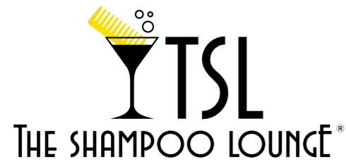
The Shampoo Lounge Location: Bali