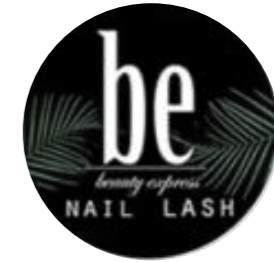
Beauty Express Location: Jakarta Barat